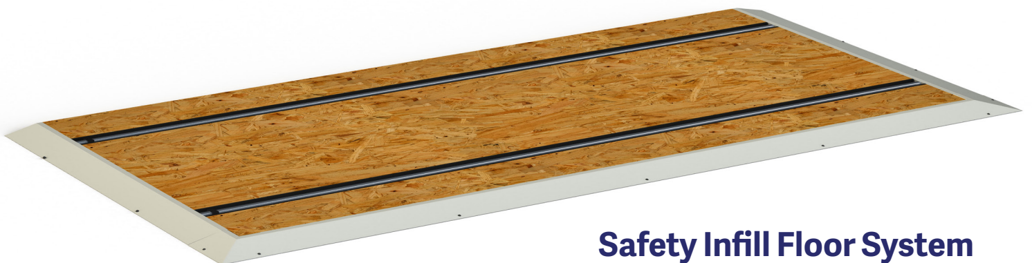
Safety Infill Floor System