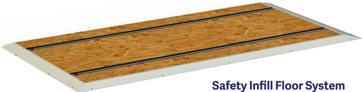
Safety Infill Floor System