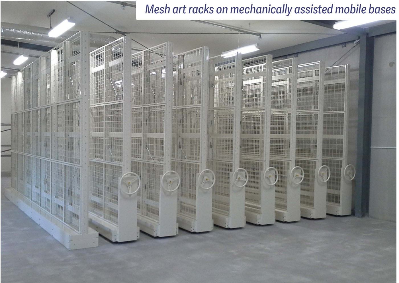
Mesh art racks on mechanically assisted mobile bases